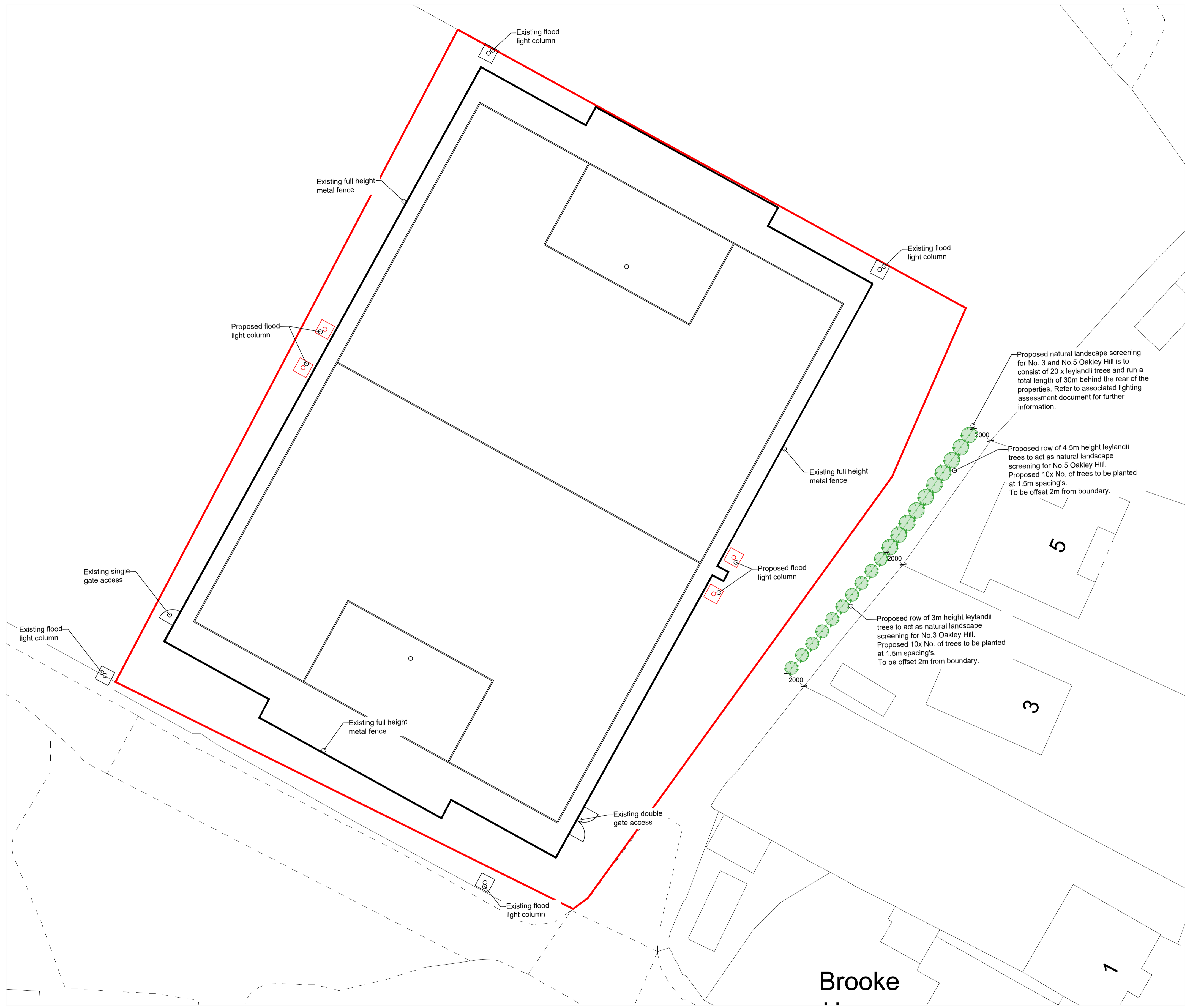
Proposed Site Plan Scale 1:200 @ A1